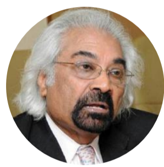
Sam Pitroda Chairman Pitroda Group