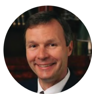
Scott McCallum Former Governor Wisconsin